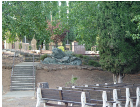
Outside area looking to fountain

Galilee Lutheran Church is a great place to get married for many reasons. Our warm atmosphere and our exceptional friendliness will make your experience a great one. You see, we really do care about you and your special day, and we truly enjoy orchestrating and doing weddings.