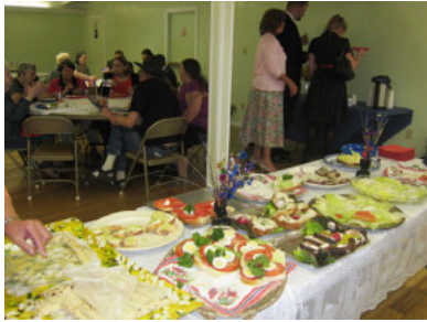
Food prepared from our kitchen facilities

We take special care in ensuring your wedding or special occasion is celebrated to your wishes.