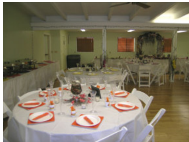
Table setting in Fellowship Hall

We will be happy to assist in any way we can. There are many Lake County wedding caterers, photographers and types of lodging available in the Kelseyville and Lake County area.