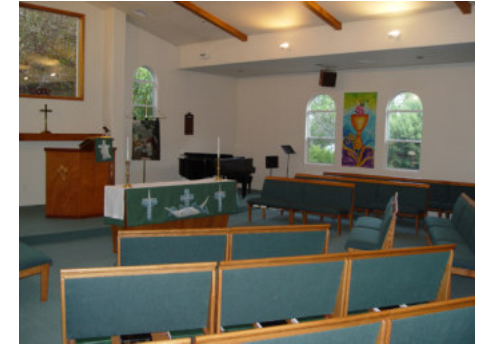
Sanctuary for weddings

Galilee is a beautifully landscaped site containing a Sanctuary, an outdoor area with a rock fountain, and a beautiful Fellowship Hall. The setting is absolutely charming and romantic, inside and out, and we have been told countless times that we have one of the loveliest settings in Lake County.