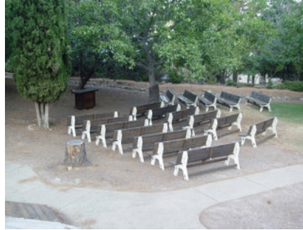
Outdoor area seating

Working with Galilee, we will be able to create a celebration you and your guests will enjoy from beginning to end.