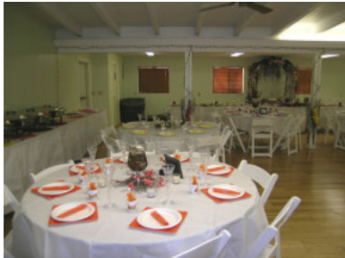
Table setting in Fellowship Hall

We will be happy to assist in any way we can. There are many Lake County wedding caterers, photographers and types of lodging available in the Kelseyville and Lake County area.