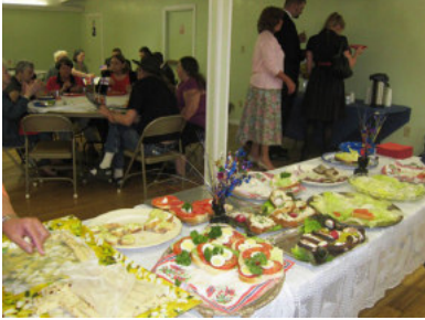
Food prepared from our kitchen facilities

We take special care in ensuring your wedding or special occasion is celebrated to your wishes.